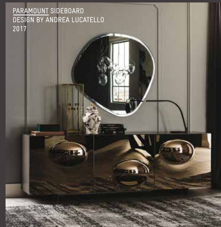
PARAMOUNT SIDEBOARD DESIGN BY ANDREA LUCATELLO 2017