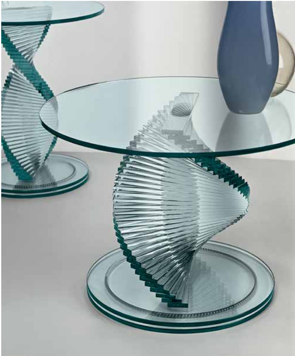
ELICA Glass Table Design by Isao Hosoe