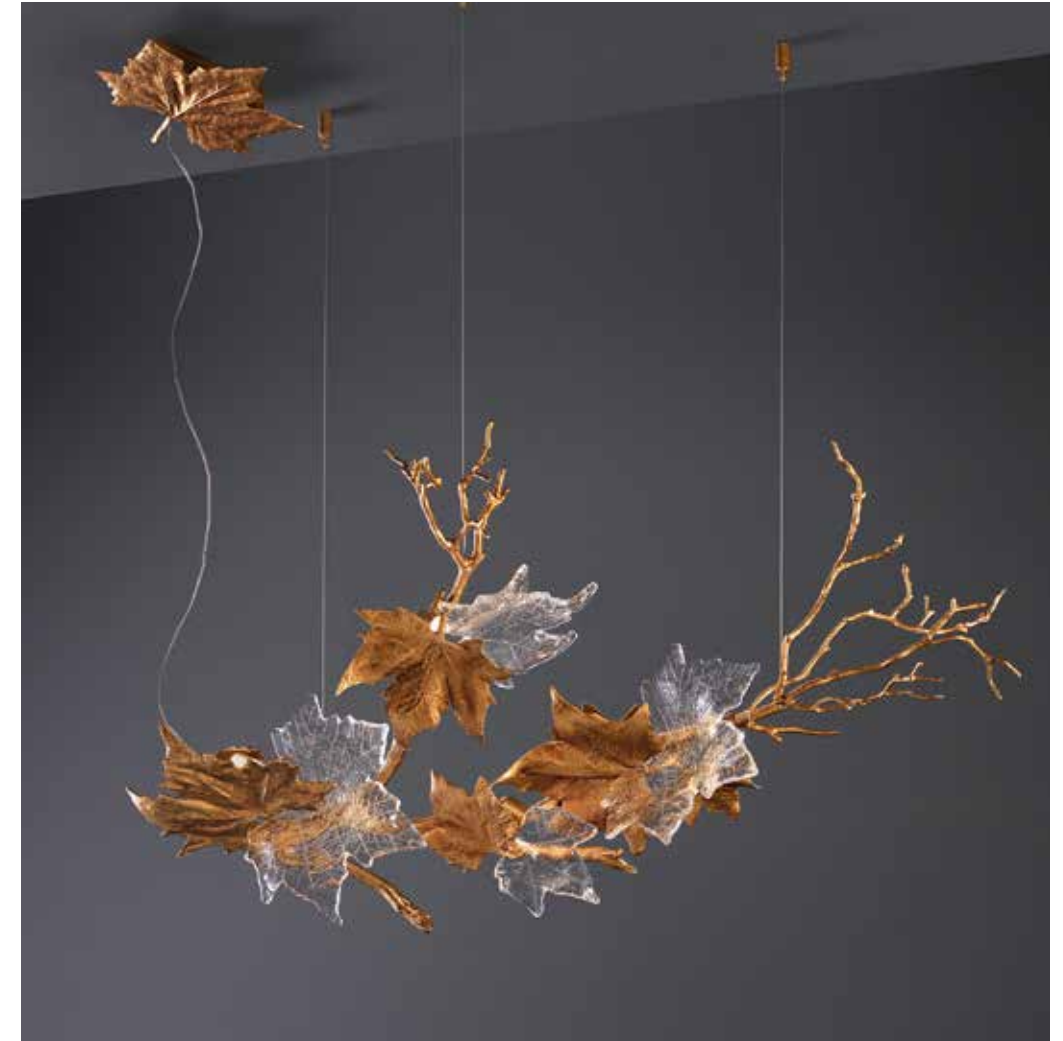
FOLIO Horizontal Medium Chandelier