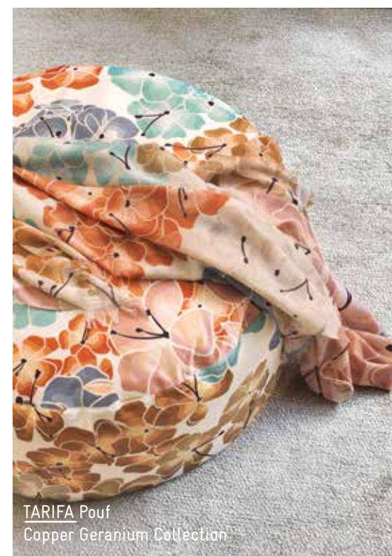
TARIFA Pouf Copper Geranium Collection