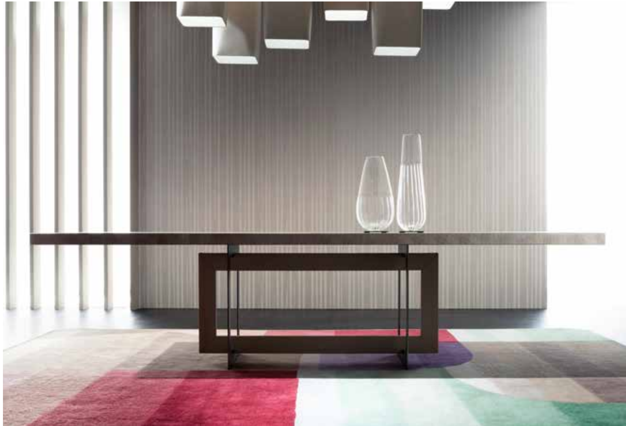
BLADE Dining Table Design by G. SORESSI 2017