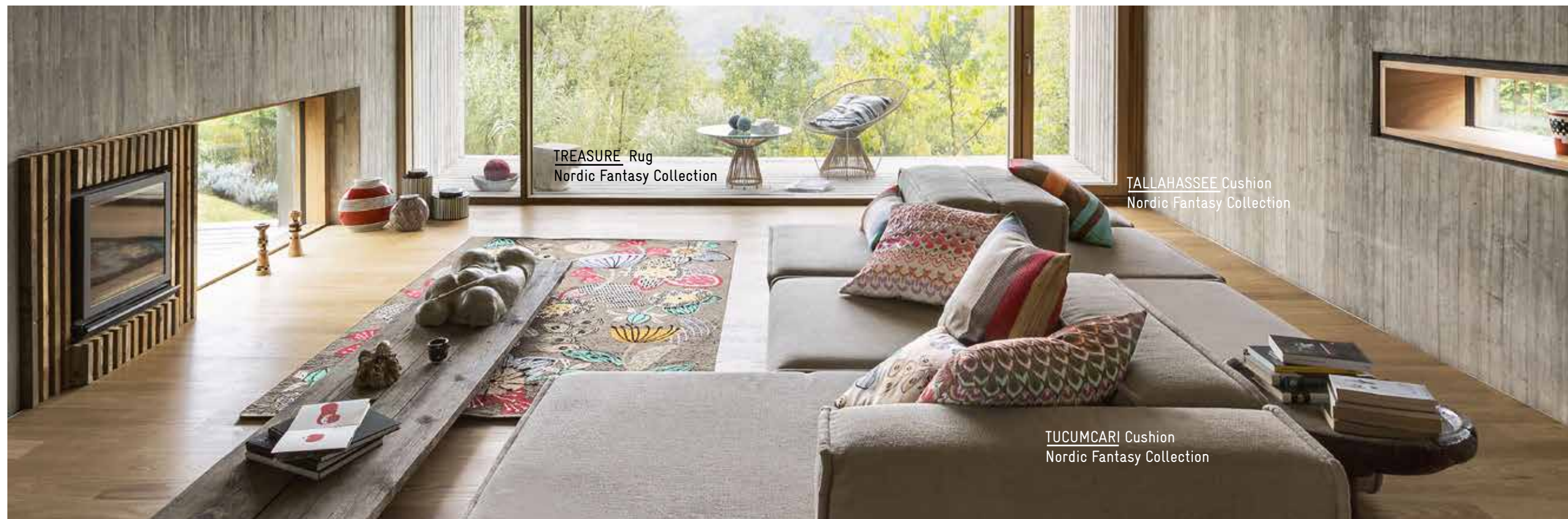
TREASURE Rug Nordic Fantasy Collection