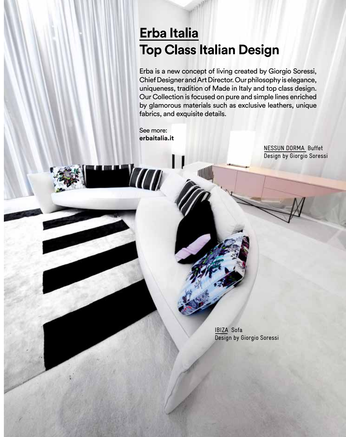
IBIZA Sofa Design by Giorgio Soressi