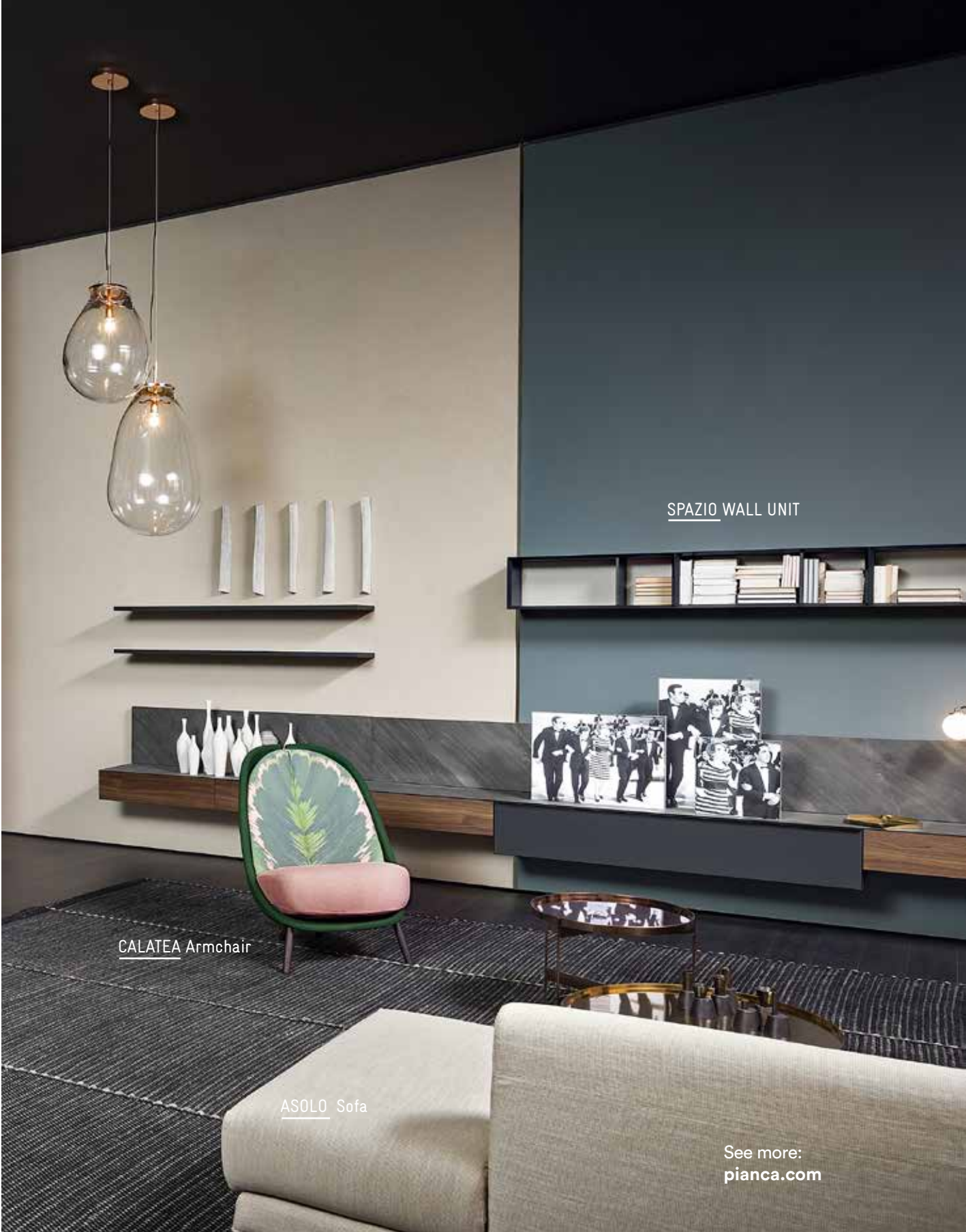
SPAZIO WALL UNIT