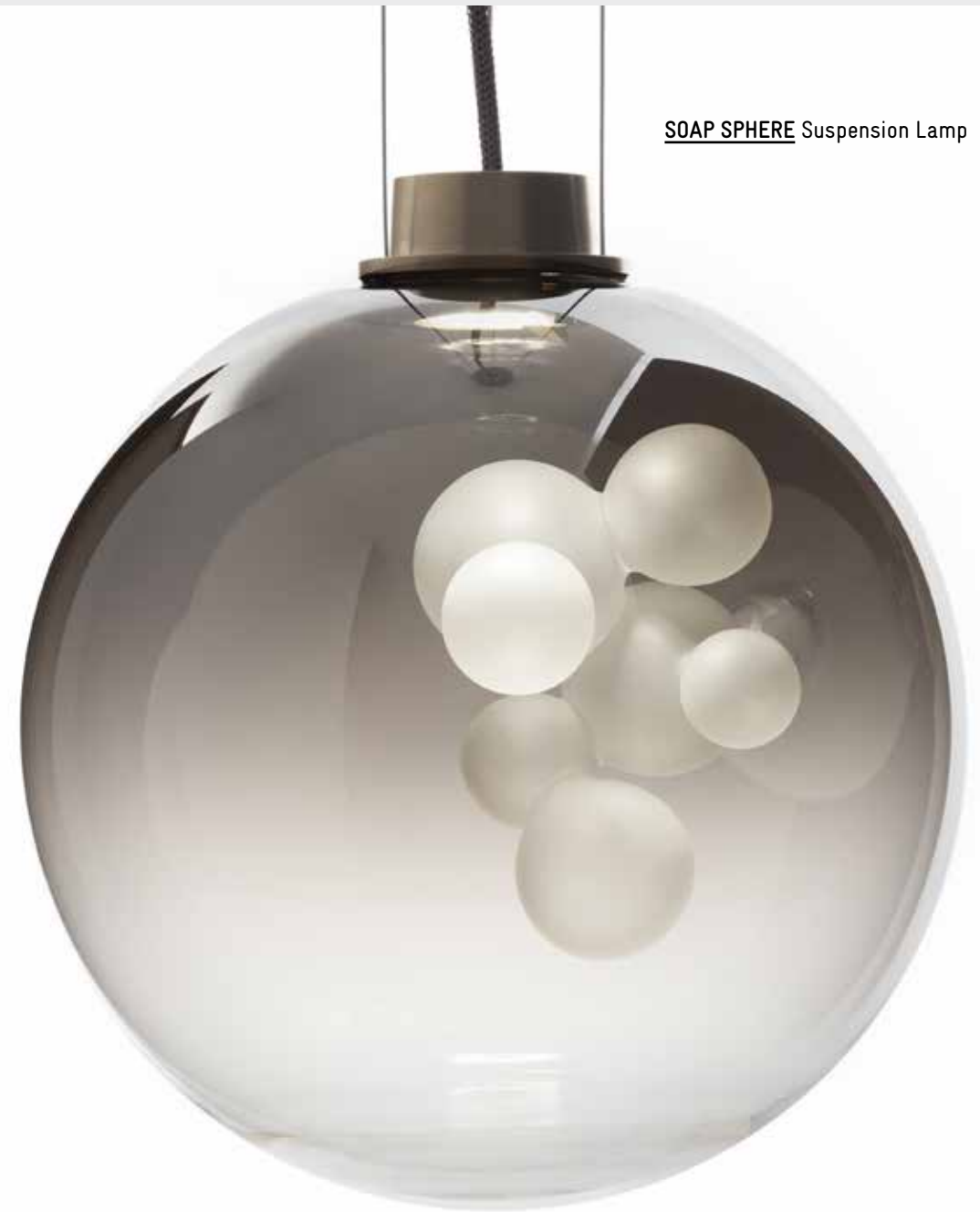
SOAP SPHERE Suspension Lamp