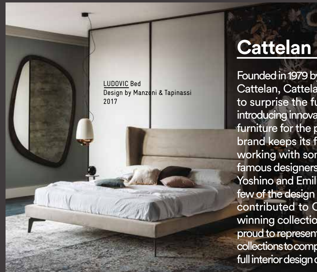
LUDOVIC Bed Design by Manzoni & Tapinassi 2017