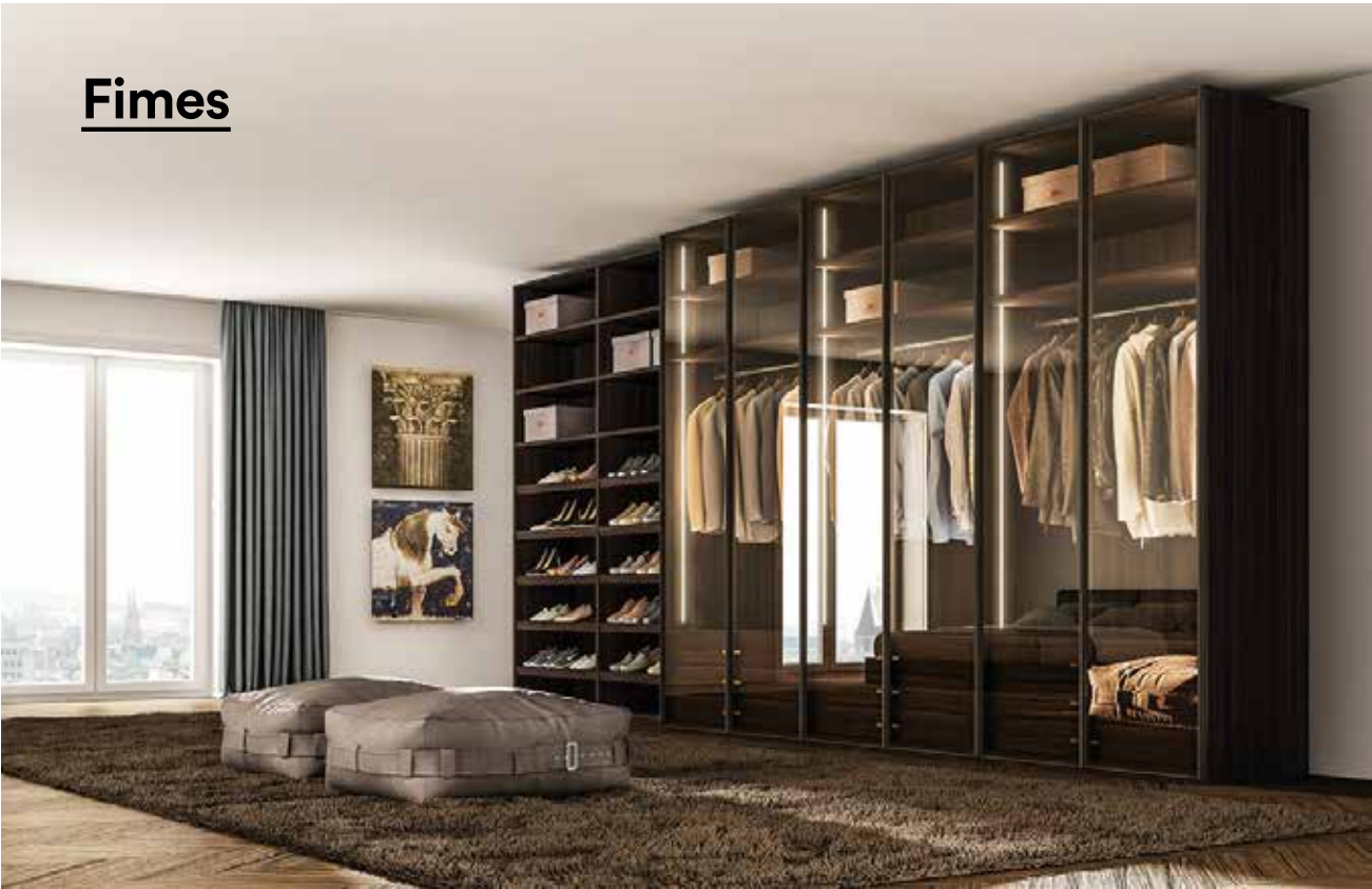
RIQUARDO TRANSPARENTE Wardrobe