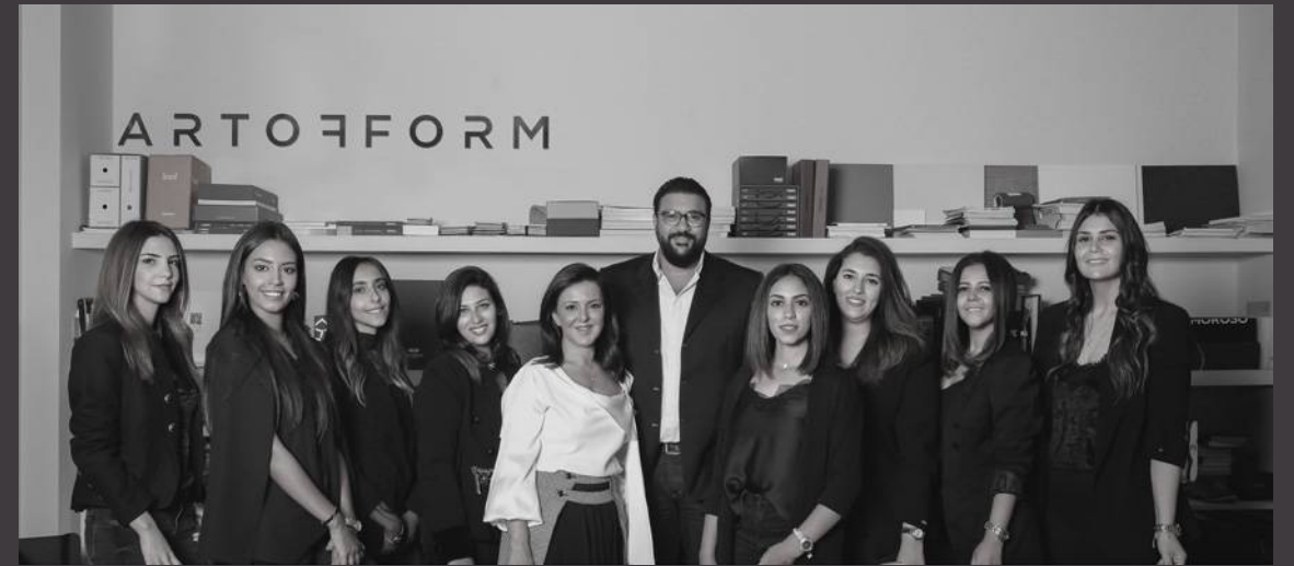
Our FF&E consultants team

Today we are a team of design professionals working with a highly trained and experienced eye for refined taste, high-style furniture and objects. Our work is a meticulous process of conversations, ideas, sketches, drawings and decision-making. Our goal with every project is to bring our vision, philosophy and world-view to life, but also to experiment and reinvent ourselves everytime to discover new forms of living.