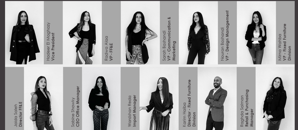
Our senior management team

Today we are a team of design professionals working with a highly trained and experienced eye for refined taste, high-style furniture and objects. Our work is a meticulous process of conversations, ideas, sketches, drawings and decision-making. Our goal with every project is to bring our vision, philosophy and world-view to life, but also to experiment and reinvent ourselves everytime to discover new forms of living.